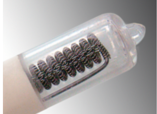
Lamp-Coat™ LC4040-SG applied to IR heater.