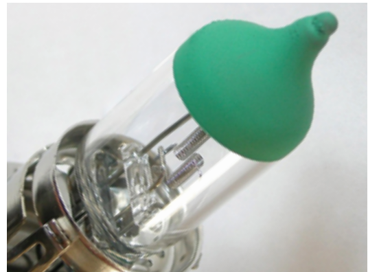
Ceramacoat™ 845-GLT applied to auto headlamp.