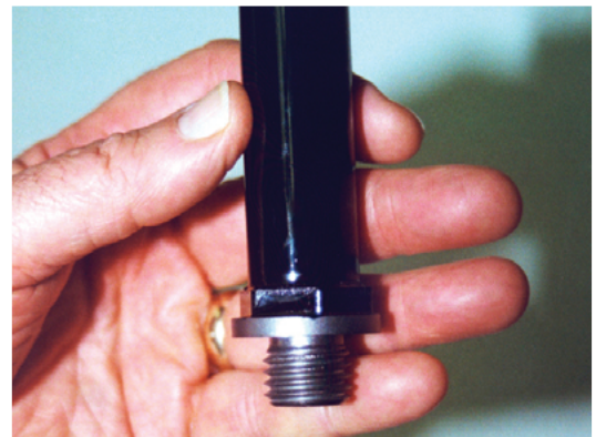
CP2000 seals thermal spray on small heater.