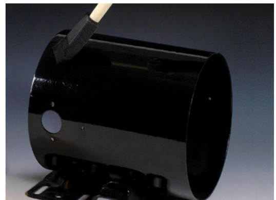
CP2000 seals thermal spray on motor housing.